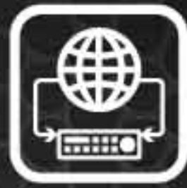
Software Upgrade via Network, USB Port