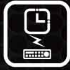
NTP (Network Time Protocol)