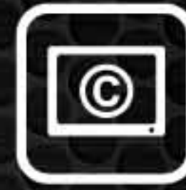
WCS (Watermark Check System)