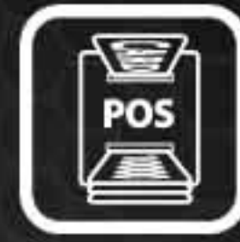
POS (Patent Pending)