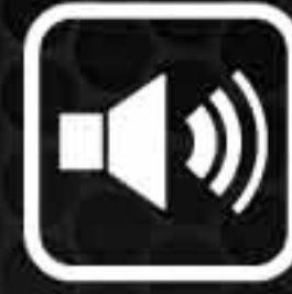
Audio Recording & Playback