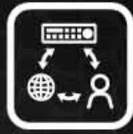
DDNS & DHCP Support