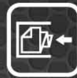
Archiving (JPEG, EXE Format)