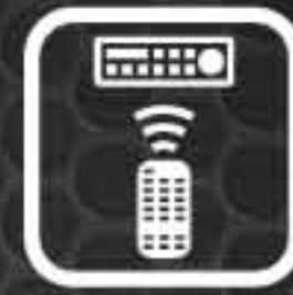
IR Remote Controller