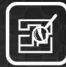
E-MAP Function Support